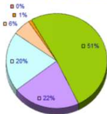
Expenditure in the last month