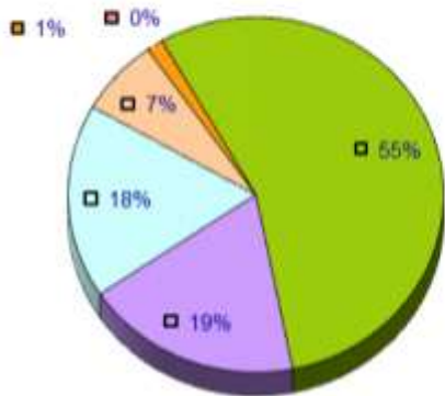
Expenditure in the last month